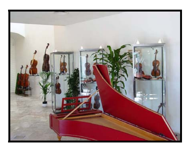
Exhibition in Ibiza, September-November, 2004

It is a novel approach for presenting these instruments and their history. The instruments will be embedded in their proper ambiance and historical context: each hall recalls rooms from different places and periods. Some halls are even equipped with newly-designed interactive computer-video equipment.