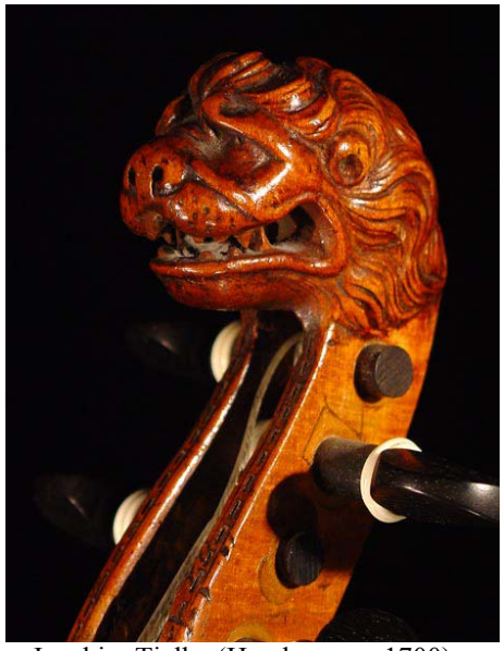
Joachim Tielke (Hamburg, ca.1700)