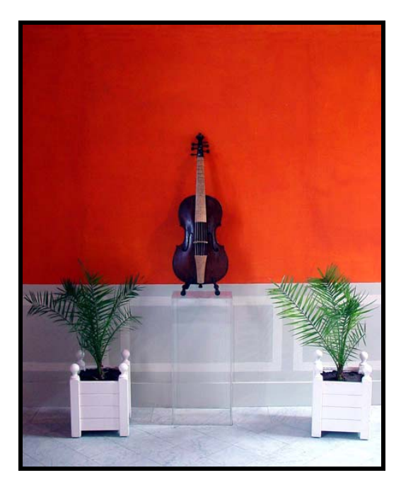
Exhibition in Rambouillet /France, 2004