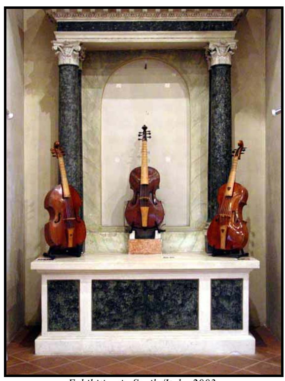
Exhibition in Sacile/Italy, 2003

A DVD containing this film, the entire catalog and the translations in French, German and Spanish will accompany the catalog, but may also be made available separately.