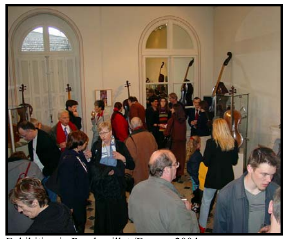
Exhibition in Rambouillet /France, 2004

Similar to the work at the Vienna University, the students are outfitted with the instruments of the collection and work on Renaissance, Baroque and Classical repertory under the direction of the members of the Orpheon Foundation. The goal is to prepare a historically informed performance of these works in public.