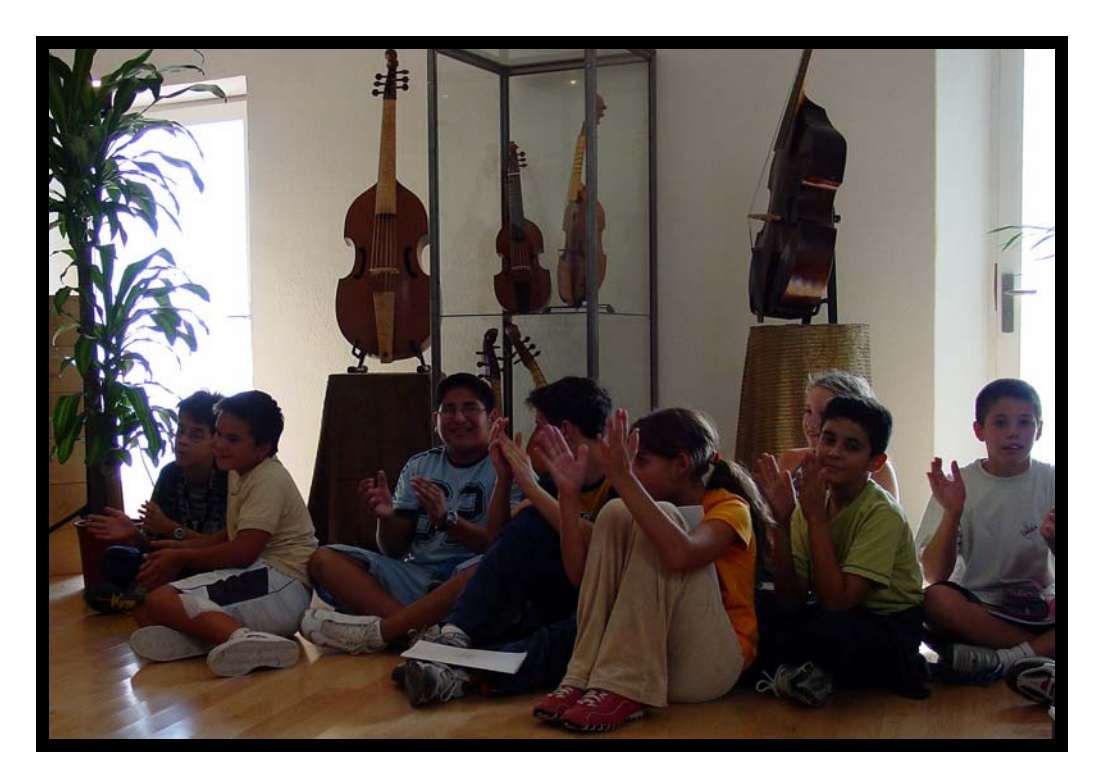
During the exhibition in Ibiza: September – Novembre, 2004