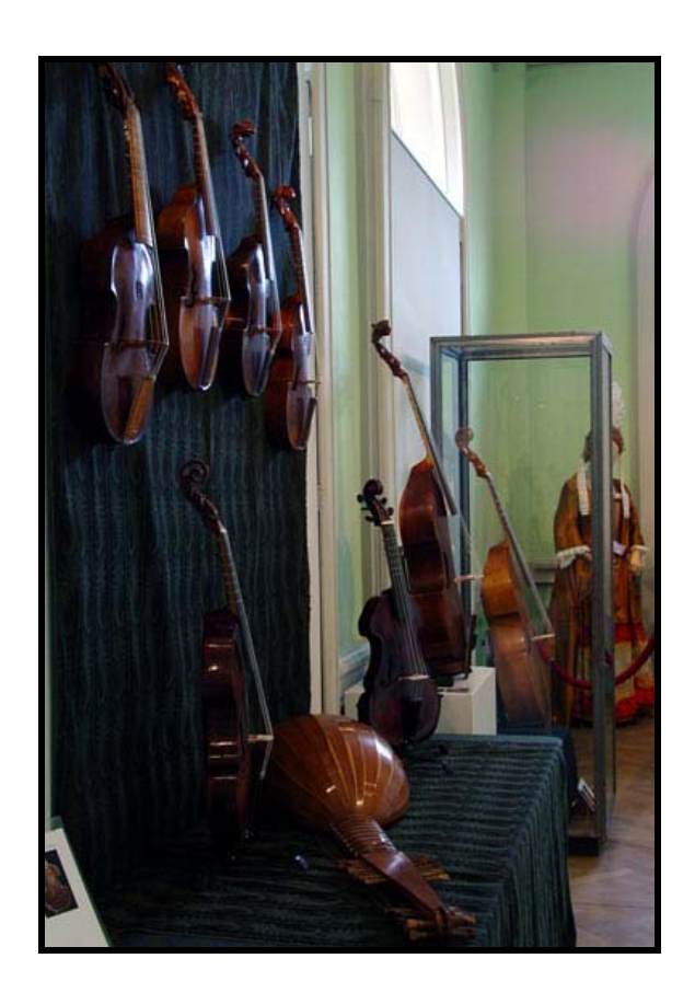
Exhibition in Rambouillet /France, 2004

The collection possesses such a magical fascination that can it be appreciated by the general public: the exhibitions of the past, which have brought these instruments as far as Taiwan, bear witness to this. Performing on these instruments is an immensely valuable learning experience for the musicians. Hearing their sounds in the appropriate ambiance is an unforgettable experience for the listeners. What results is a marvellous, indescribably enriching interaction between instrument, performer and listener. This is what we desire to achieve in this project.